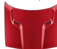
Inferno Red Crystal Pearl