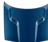
Deep Water Blue