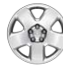
17" Wheel Cover Std. SE