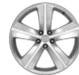
20" SRT® Forged Aluminum Std. on SRT8®