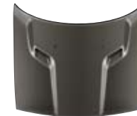
Dark Titanium Metallic