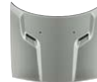
Bright Silver Metallic