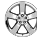
20" Chrome-clad Cast Aluminum Opt. R/T