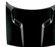
Brilliant Black Crystal Pearl