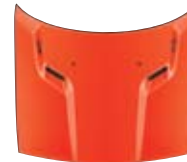
Hemi Orange R/T only

*Limited availability. Since the time of printing, some of the information you'll find in this brochure may have been updated. Specifications and all competitive comparisons are as accurate as known at the time this publication was approved for printing.