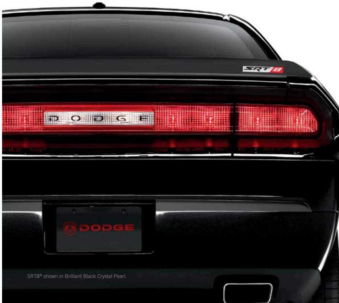
SRT8® shown in Brilliant Black Crystal Pearl.