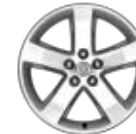
18" Cast Aluminum Std. R/T, Opt. SE